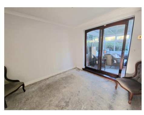
BEDROOM THREE 9' 6" x 7' 7" (2.89m x 2.31m)